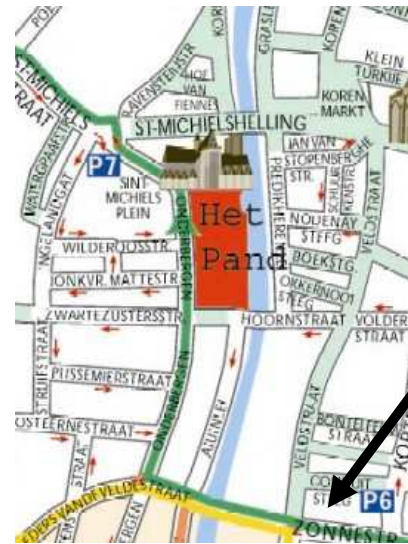
Tram stop Zonnestraat

Some trains also run directly from the airport to “ Gent-Sint-Pieters ”.